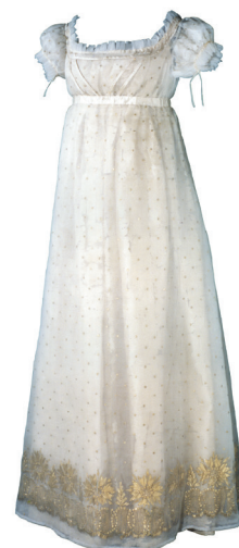
French manufacture, Dress, early 19 th century; below: Tuscan manufacture, Paliotto, detail, 1601