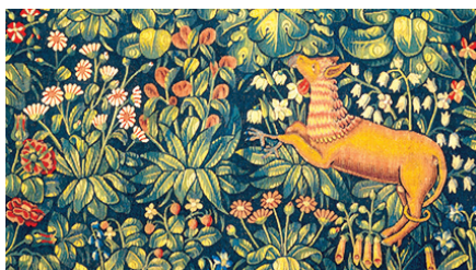
Millefiori Tapestry, detail

works have also been found a home in the building: a Pomona by Marino Marini, dated 1945, and a painting cycle of dry-laid tempera by the painter Giovanni Boldini from Ferrara. The Bigongiari Collection has recently been established, with over forty paintings representing the most important private collection on the Florentine 17 th century. The museum also houses the Millefiori Tapestry . Known as the Adoration , it is a splendid example of 16 th -century Flemish tapestry weaving. MAP → 3