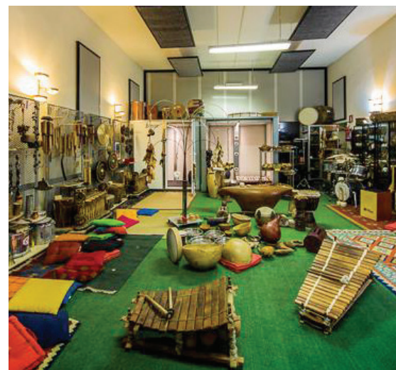
Museum of Music and Percussion Musical Instruments

The company is recognized worldwide for its production of handmade cymbals. The Tronci family played an important role in Pistoia's history vis-à-vis organ construction since the mid-18 th century, which gave rise to the Pistoia organ school. MAP → 43