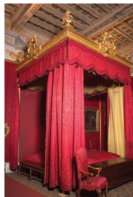
Four-poster bed in red damask, 17 th century

The Clemente Rospigliosi Museum is located on the main floor of the residence of this illustrious Pistoia family. Giulio Rospigliosi, Pope Clement IX (1667-1669) belonged to a branch of this family. The museum preserves practically intact the sumptuous 17 th -century decor of the papal apartment, set up to properly host Clement IX when he passed through the city. Especially extraordinary is the 16 th - and 17 th -century picture gallery, including twenty-five works by the painter Giacinto Gimignani. With its large four-poster bed in red damask the pope's chamber is very charming. MAP → 27