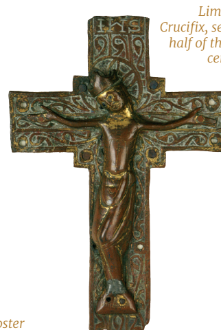
Limoges, Crucifix, second half of the 13 th century

The Diocesan Museum is housed in the monumental rooms adjoining the Rospigliosi apartment. It contains valuable objects of sacred art, mainly jewelry, which have come from the churches in the diocese. On display are silver objects, sacred vessels, paintings, statues, and liturgical vestments. They are arranged in chronological order, following formal transformations in the taste and style of these objects intended for sacred ceremonies. MAP → 27