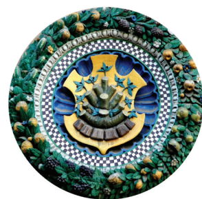
The Della Robbia Frieze, detail; below: Anatomical Theater

dating from the 18 th century to the early decades of the 20 th century. Two other sections are dedicated to the former psychiatric hospital at the Sbertoli Villas and to the Filippo Pacini Medical Academy. In the garden of the former hospital the visit to the museum is concluded with the small 18 th -century Anatomical Theater , evidence of the medical-surgical school first active in the 17 th century. MAP → 8